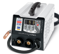
SPEEDLINER PREMIUM EXPERT 200 - 068780 SPEEDLINER PREMIUM EXPERT 230 - 068803 SPEEDLINER PREMIUM EXPERT 400 - 068827